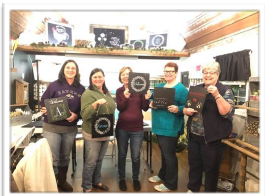
Our members with their projects at Bricolage Barn.

Officers needed: President and program chair.